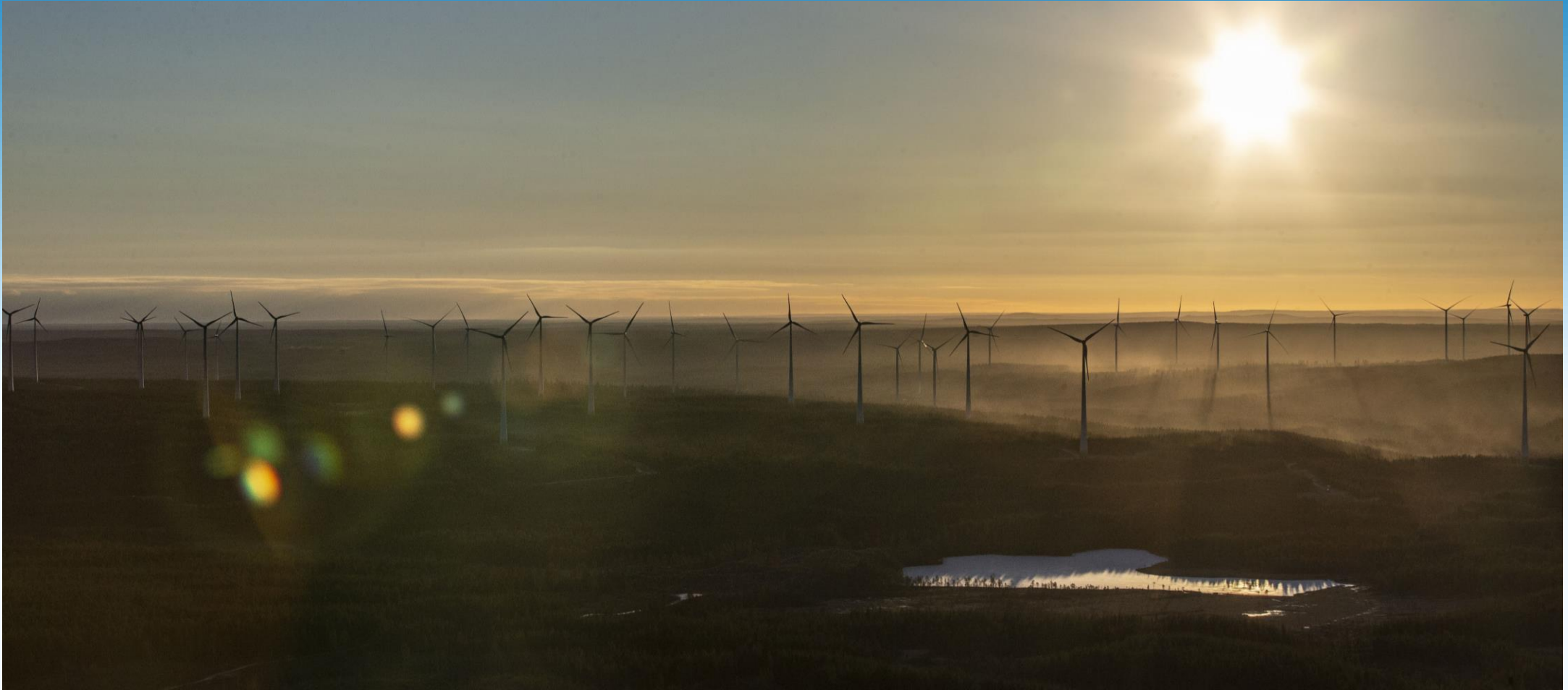
A wind turbine in a field