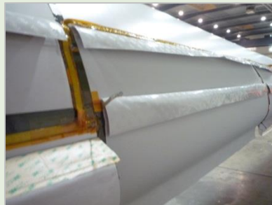
Installation on a blade in progress