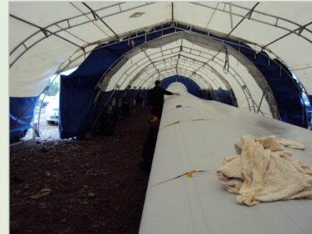
Heater installation in fully enclosed area