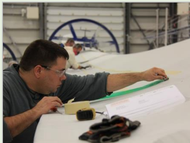
Outlining and preparation of installation

After installation, GreenWIND Global representatives can be present to accompany the blade to the wind turbine site to ensure proper handling and care is taking place, and that no damage has occurred during the transport process.