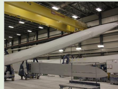
Completed installation on a blade