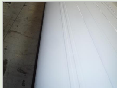
Completed installation on a blade