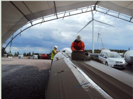
Heater installation in partially enclosed area