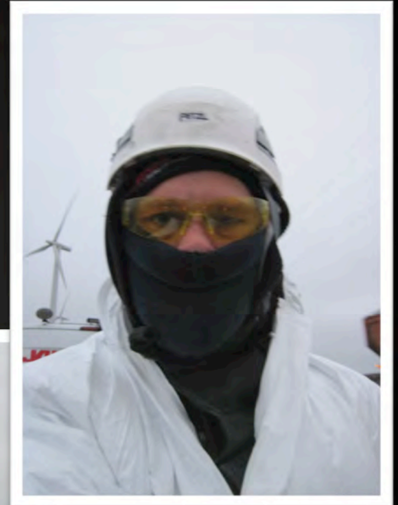
..even in cold climate