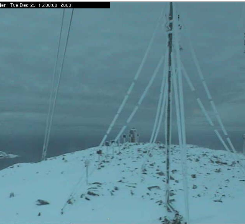
Mast 23.Dec 2003