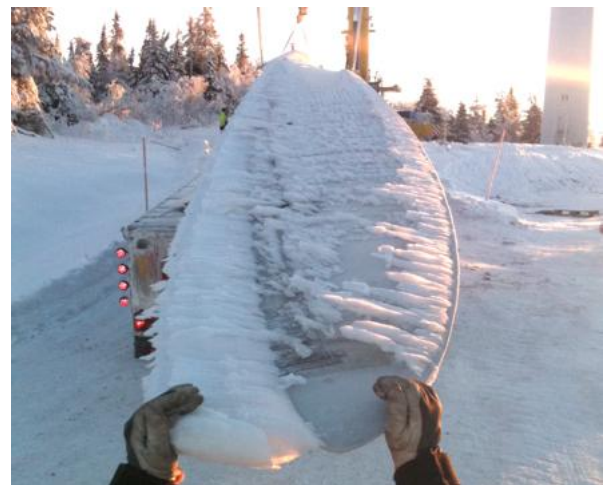
Figure 1: Ice collected on a wind turbine blade, which was taken down for the removal of a de-icing system.

Figure 1 shows a significant amount; several hundred kg, of ice collected on a non-de-iced wind turbine blade.