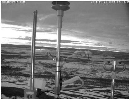
Figure 3: A view of the instruments at the Sjisjka icing measurement station. This particular mast is 60 m tall.

At most of the measurement stations there's been a camera installed to enable verification of the icing measurements. The cameras have provided valuable empirical data not only for ice build-up, but also for ice ablation (melting, sublimation and breaking off). Inherently difficult to calculate, the cameras have captured when brittle ice has braked into pieces at low temperatures.