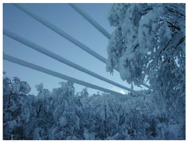
Figure 2: Snow load on power line

Preliminary studies within the frame of COST action 727 "Atmospheric Icing of Structures" showed that reasonable ice loads could be obtained by using the microphysical fields from an early version of the Weather Research and Forecasting (WRF) model (e.g. Harstveit et al. 2009; Nygaard 2009). Ice loads calculated from an updated WRF based model archive developed at Kjeller Vindteknikk have made it possible to reproduce and estimate the return periods of the 2013/2014 winter's icing events. There is however a large potential to further develop these objective methods, and use the tools within a consistent NWP model framework for quantification of changes in the icing climate in Norway.