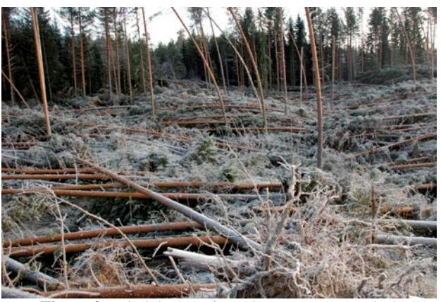
Figure 3: Wind damage from the storm Dagmar in 2011

Increased attacks by the spruce bark beetle can be expected after wind and snow damage, in particular with increasing temperatures (Schlyter et al. 2006). Falling trees or tree tops generate considerable damage on infrastructure, mainly roads, railways and power lines. The damage risk can be decreased through appropriate forest management, and scenarios make up an important basis for decisions on altered management. This includes changing tree species, providing the trees generous space at low age (increasing 'single tree stability'), avoidance of late and heavy thinning (increasing 'social stability'), and careful placement of stand edges after clear-cut in the landscape (Nielsen 2001, Albrecht et al. 2012).