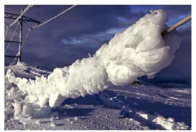
Figure 1: In-cloud icing on a power line

Atmospheric icing is a major weather hazard in many midto high-latitude locations in the winter, including Norway. There are mainly three types of atmospheric icing; (1) 'freezing fog', i.e., in-cloud icing due to (supercooled) liquid cloud droplets at sub-freezing temperatures (Figure 1); (2) 'freezing rain', i.e., icing due to supercooled rain drops at sub-freezing temperatures; (3) 'wet-snow icing', which is caused by heavy precipitation in the form of of snow or sleet at temperatures just above freezing (Figure 2). All three types are common in central and northern Europe and North America, with (1) and especially (2) mainly occurring in continental air masses in inland regions, while (3) is most common in coastal regions, such as Iceland, the U.K., Japan and parts of Germany (Nygaard et al., 2013). Icing has been known to cause significant problems for many sectors of society, in particular for power transmission lines, wind turbines, aviation, telecommunication towers and road traffic. An extreme example of (2) is the ice storm that hit eastern North America in January 1998 with more than 100 mm of freezing rain observed in some areas (Gyakum and Roebber, 2001). This resulted in more than 4 million people in Canada and the United States losing power for days to weeks, or even months and a total economic damage estimated at 4.4 billion U.S. dollars.